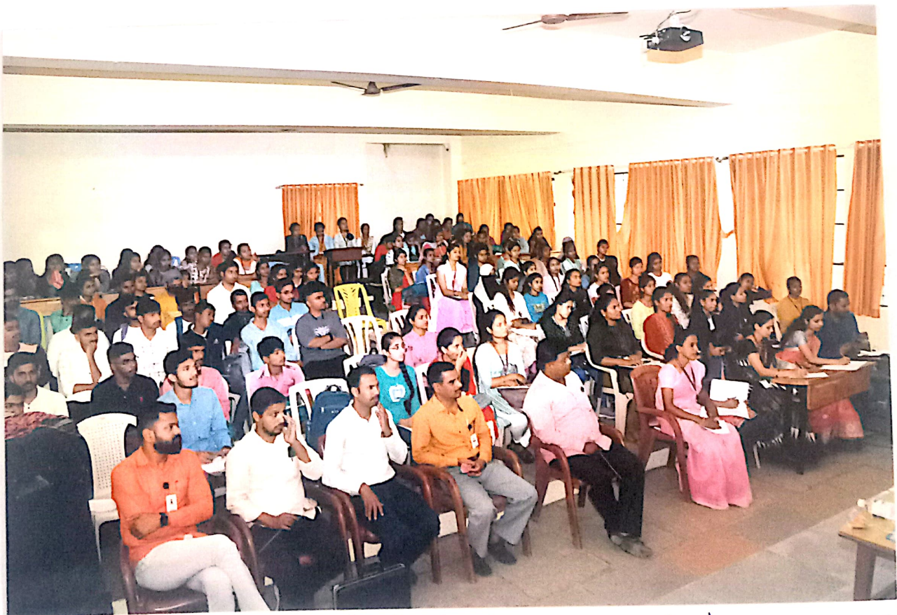
All the teachers & students attended a guest Lecture on "Online Banking".